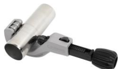
INOX TUBE CUTTER Article: 70340