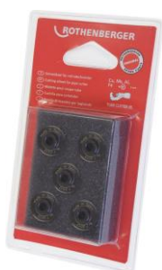
Cutting wheel for TUBE CUTTER 35, Cu-MS-Al-FE, 5 pieces Article: 070017D