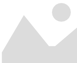
Replacement axle for MINICUT 2000/TC 35 Article: 70041