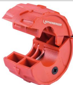
ROCUT Plastic Pro 15-22 mm Article: 1000003051