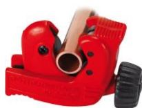
MINI MAX Article: 70015